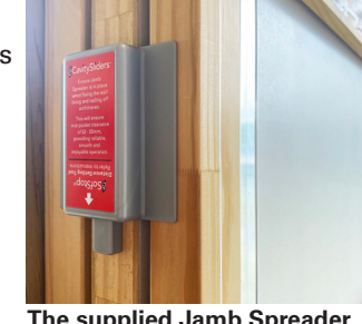
The supplied Jamb Spreader should be used during install.

In all cases it is critical to ensure that all clearances are checked prior to fixing of tiles.