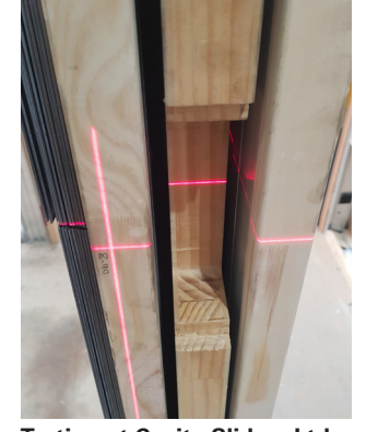
Testing at Cavity Sliders Ltd research & testing facility.