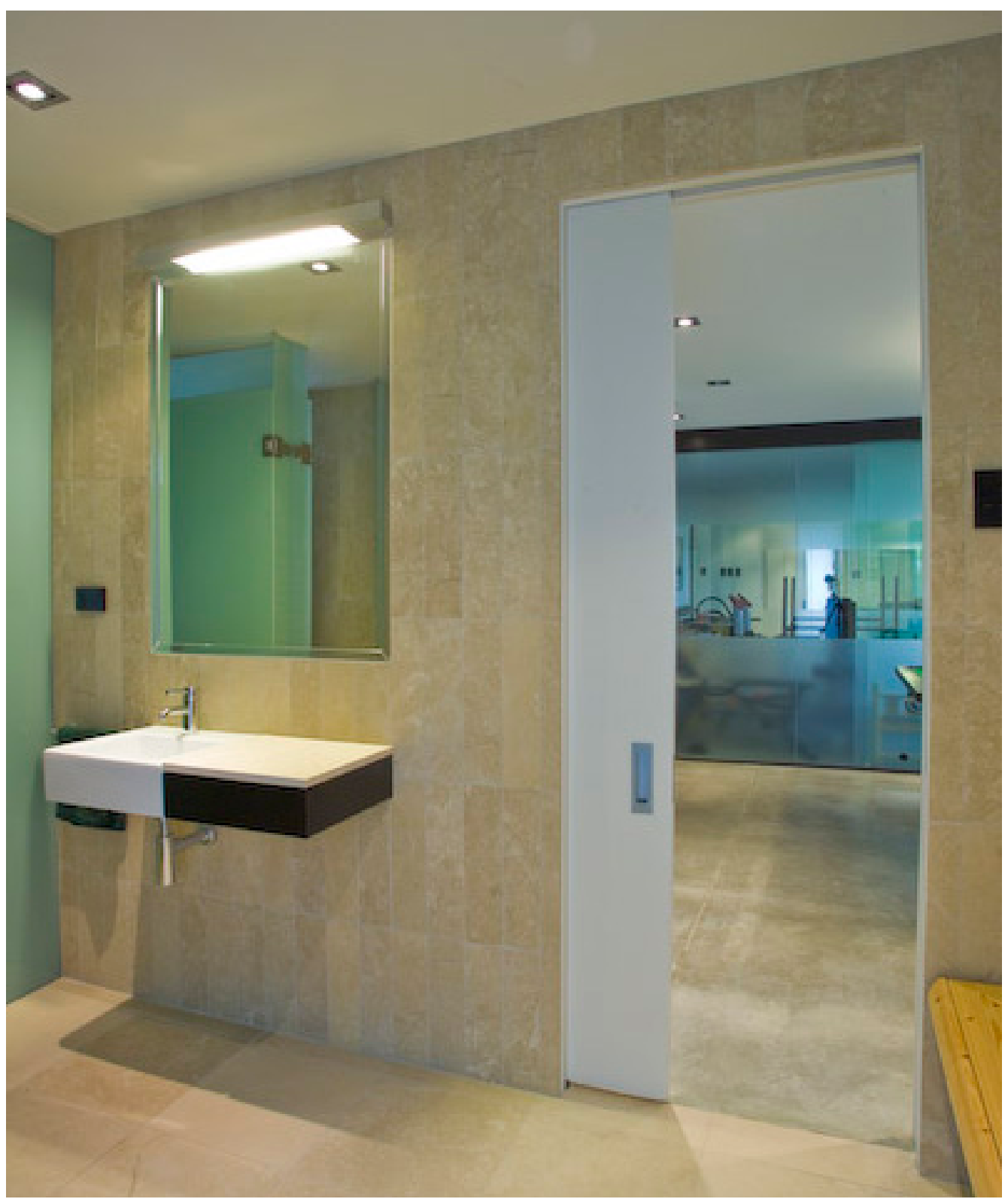
CS Cavity Slider with flush door in tiled bathroom